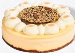
DULCE DE LECHE CHEESECAKE