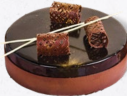
CHOCO ROYALE CAKE