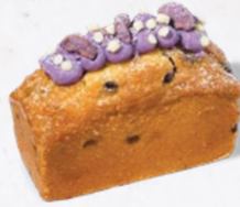
BLUEBERRY POUND CAKE