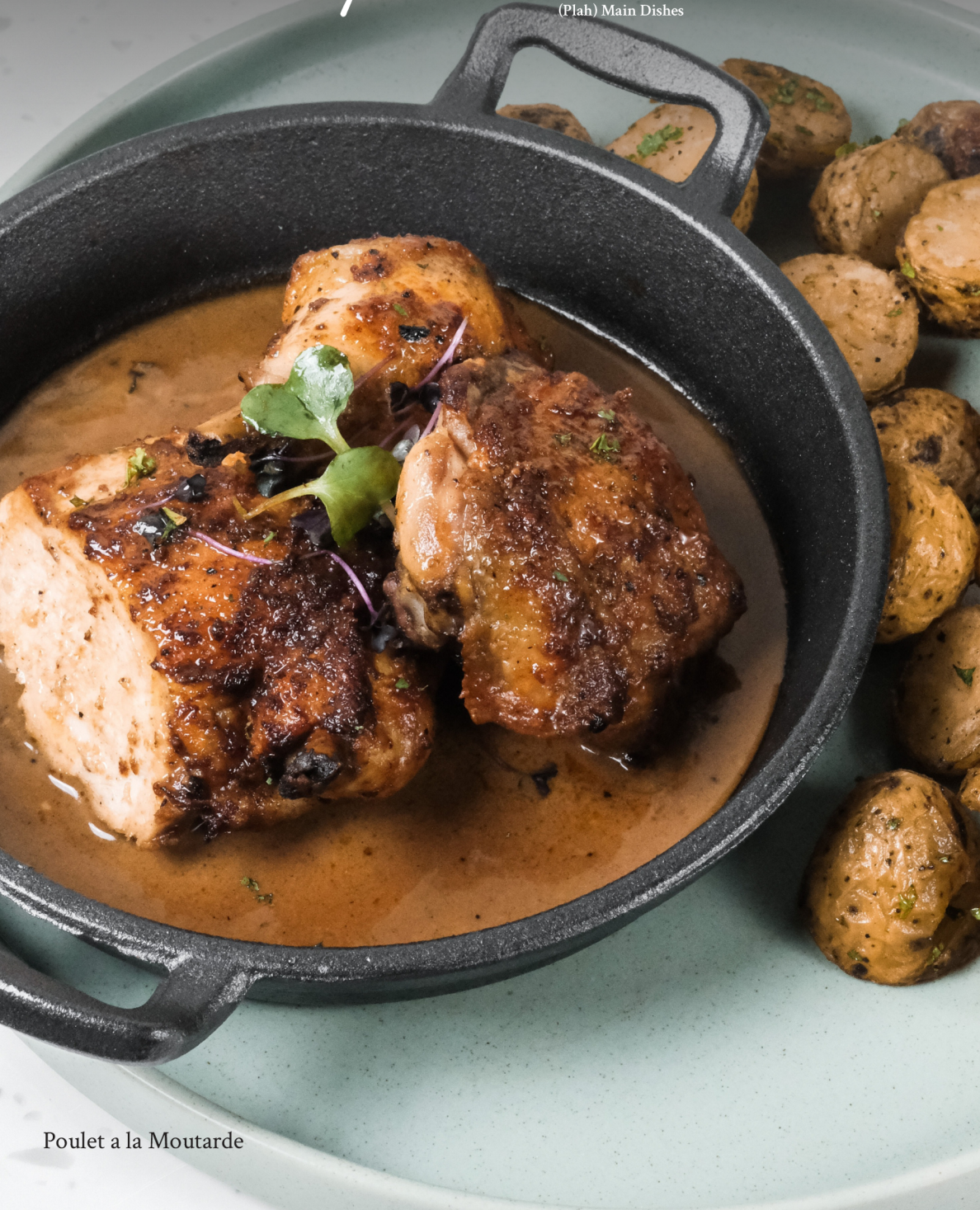
Poulet a la Moutarde