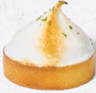
LEMON MERINGUE TART 130