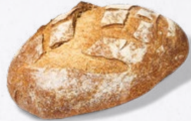
WHOLE WHEAT SOURDOUGH 200