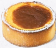
PARISIAN FLAN 230