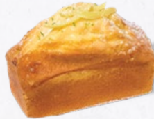
LEMON POUND CAKE