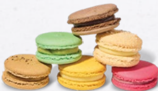
FRENCH MACARON (BOX OF 6) 510