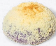
UBE CHEESE BREAD 160