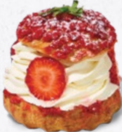
STRAWBERRY CREAM PUFF 290