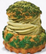
MATCHA CREAM PUFF 280