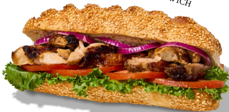
CHICKEN INASAL SANDWICH