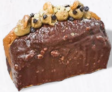
CHOCO MARBLE POUND CAKE