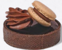
CHOCOLATE TART 240