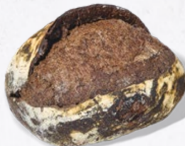
CHOCOLATE SOURDOUGH 400