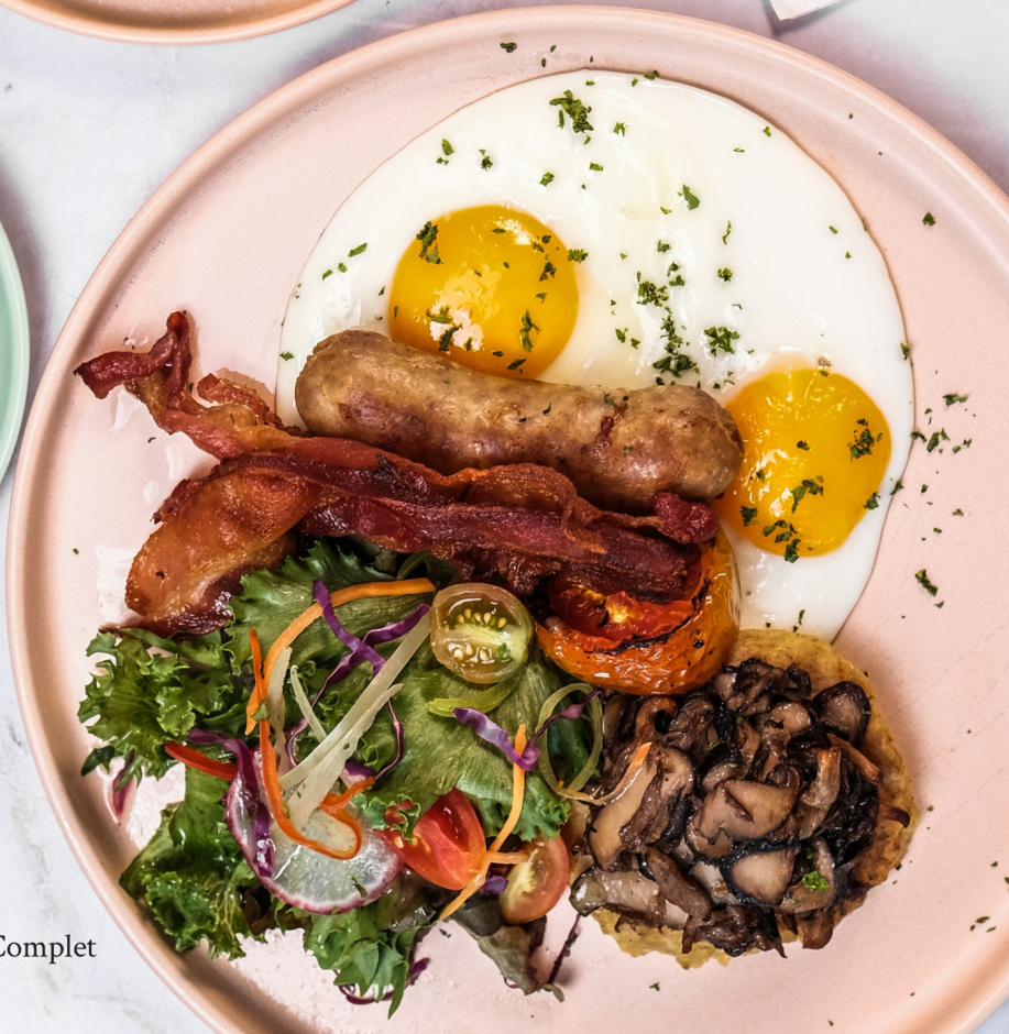
Baker J Breakfast Complet (kohm-pleh)