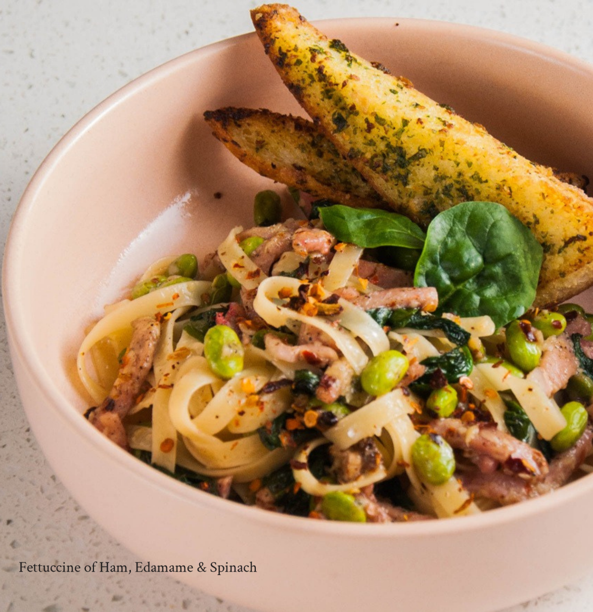
Fettuccine of Ham, Edamame & Spinach