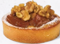
APPLE TART 130