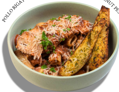
POLLO RIGATONI WITH SUN-DRIED TOMATO & WALNUT PESTO