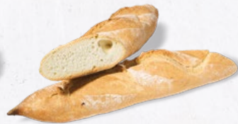
FRENCH BAGUETTE 80