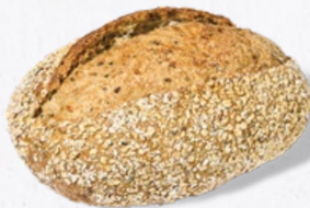
MIXED SEEDS LOAF 360