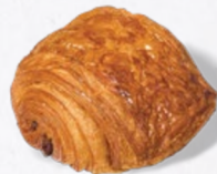
PAIN AU CHOCOLAT