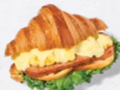
SPAM AND EGG CROISSANT