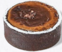
CHOCOLATE FLAN 240