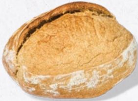
COUNTRY SOURDOUGH 200