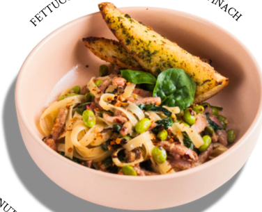
FETTUCINE OF HAM, EDAMAME & SPINACH